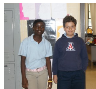
160 days left of school!